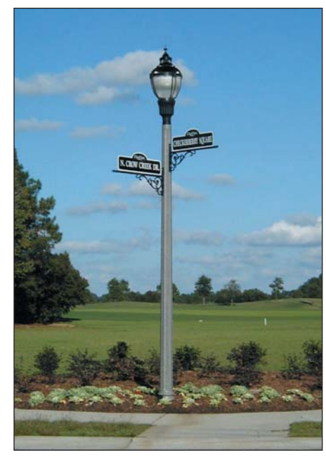
The acorn-type fixture is ideal for a home application or decorative scheme around a business.

Several different parking lot lighting layouts are available. The installation of these fixtures causes less disruption if installed during construction and landscaping.