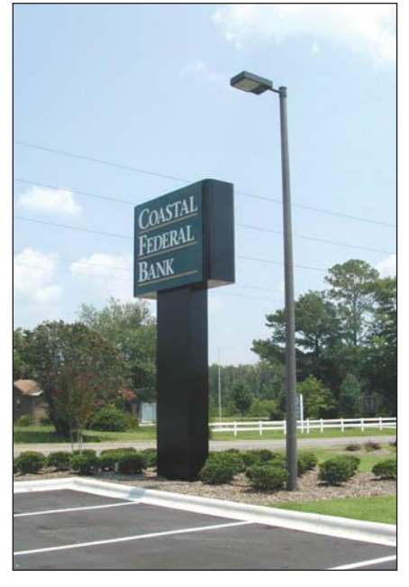
This shoebox-type lighting fixture with a concrete pole offers attractive parking lot lighting.